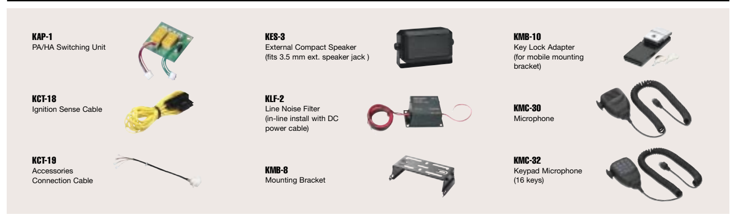
Not all accessories may be available. Please contact your dealer for details.